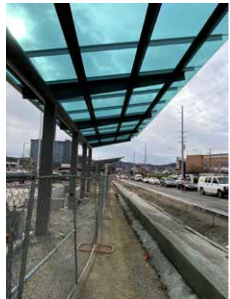
On-street canopies for bus boarding with glass installed