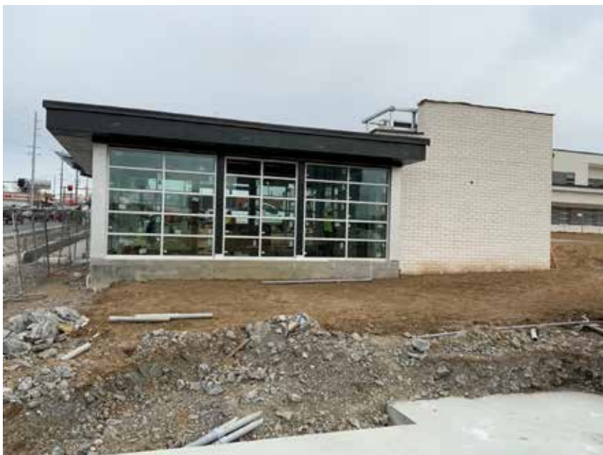
Transit center waiting room (looking north)